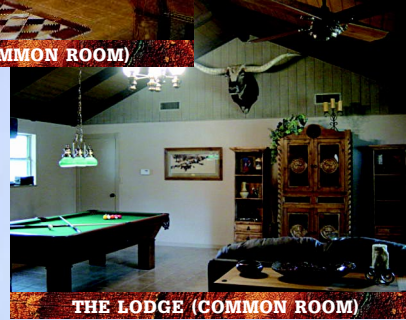
THE LODGE (COMMON ROOM)

The Common Room is available to all guests at the lodge. It is a wonderful spacious place to relax, converse, or have fun. A huge double-sided fireplace with an open hearth greets arriving guests. Comfy leather couches beckon the weary. The turn-of-the-century pool table may entice visitors into a little friendly competition, and the nearby card room (with its wagon wheel game table) has other games. Or you can hop onto a stool at the bar area and ponder the tin ceiling and antiques. The large entertainment center has a DVD/VCR television with satellite service, a stereo, movies, books, and magazines. The western decor abounds in leather, rustic wood and iron, and art by various western artists.