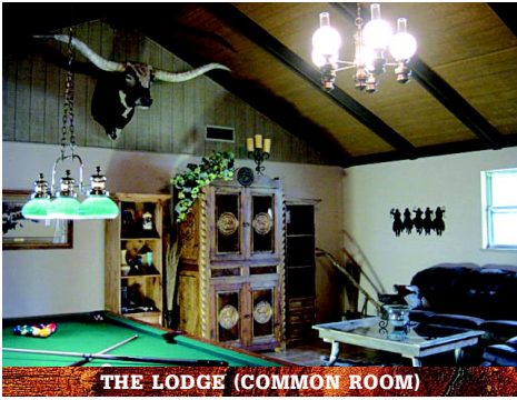
THE LODGE (COMMON ROOM)