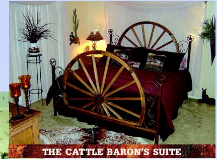
THE CATTLE BARON'S SUITE