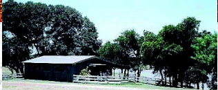
CABIN AT THREE OAKS LAKE

Place for map, directions and other information about reservations or whatever you would like.