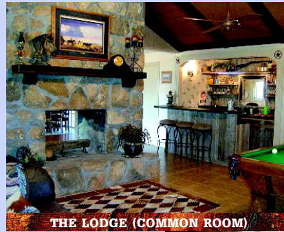
THE LODGE (COMMON ROOM)

The Common Room is available to all guests at the lodge. It is a wonderful spacious place to relax, converse, or have fun. A huge double-sided fireplace with an open hearth greets arriving guests. Comfy leather couches beckon the weary. The turn-of-the-century pool table may entice visitors into a little friendly competition, and the nearby card room (with its wagon wheel game table) has other games. Or you can hop onto a stool at the bar area and ponder the tin ceiling and antiques. The large entertainment center has a DVD/VCR television with satellite service, a stereo, movies, books, and magazines. The western decor abounds in leather, rustic wood and iron, and art by various western artists.