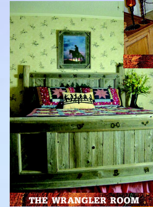
THE WRANGLER ROOM

The CATTLE BARON'S SUITE consists of a main room with an adjoining sitting room, and a private bathroom. The main room features an unusual wagon wheel styles king-sized bed with brand new pillow-top mattress and bedding. It is furnished with rustic furniture, ceiling fan, and a television with satellite service. The sitting room has a trundle bed which can be used as an additional twin or king-sized bed. The private bathroom has a large shower. A large, colorful cowhide rug, western pillows, and a horseshoe lamp are just part of the western decor and rustic charm of the room. Sleeps 1-4.